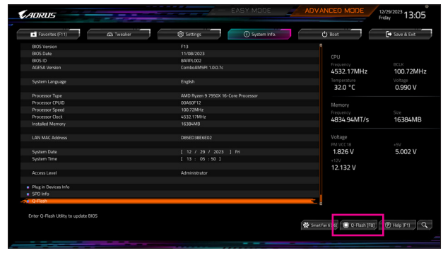
Click Q-Flash (F8) or select the Q-Flash item on the System Info. menu to access Q-Flash.