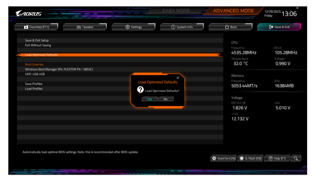
Select Yes to load BIOS defaults

During the POST, press <Delete> to enter BIOS Setup. Select Load Optimized Defaults on the Save & Exit screen and press <Enter> to load BIOS defaults. System will re-detect all peripheral devices after a BIOS update, so we recommend that you reload BIOS defaults.