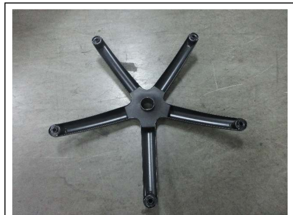
Sample as received - View 2

SGS authenticate the photo on original report only