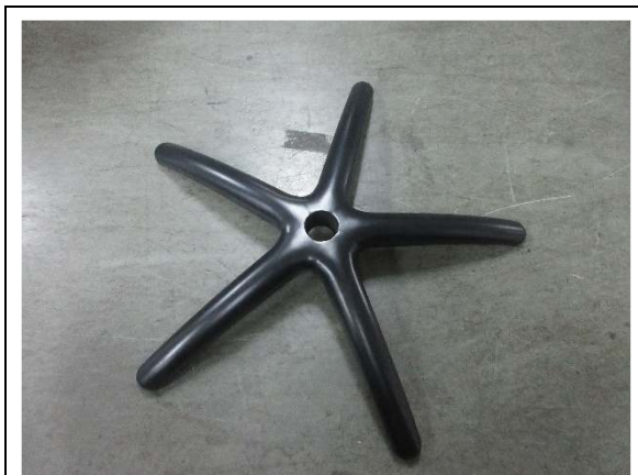
Sample as received - View 1