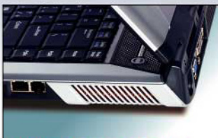
• Avant-garde slanting air vents like a sports car

W511 has been designed with the concept of heat plates on the top-class sport cars. The streamlined design and innovative color separation technique have been applied to shape the avant-garde slanting vents on the sides extending to the battery compartment, demonstrating tremendous power and mobility like a sports car.