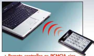
• Remote controller as PCMCIA size