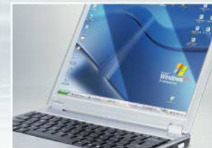
XGA LCD screen delights your life

With its stunning ultra vivid glare-type LCD (200-nit brightness), N211U presents clear and sharp images.