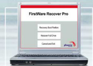
Magic F9 recover button

With its stunning ultra vivid glare-type LCD (200-nit brightness), N211U presents clear and sharp images.