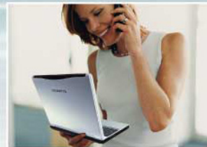
Newest "Sonoma" 12.1" light laptop Newest high-effect "Sonoma" technology Light and lovely laptop weighs no more than 2kg.