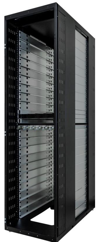
OCP 21" Rack